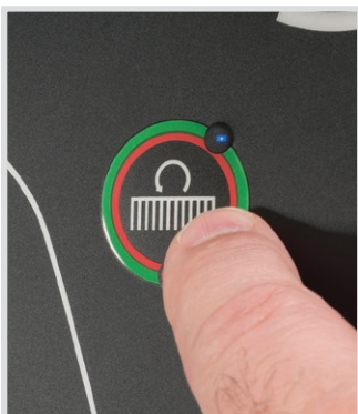
Scrubbing One-Touch™ scrubbing.