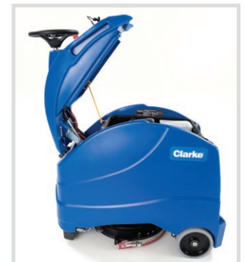
Clam Shell Design The clam shell design makes charging easy, with virtually no increase in the machine's foot print. This allows it to easily fit into a cramped janitor's closet.