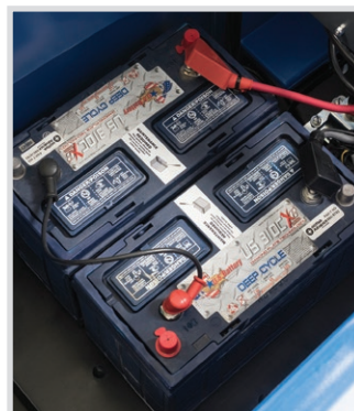
Battery Compartment The SA40™ is available with wet or AGM maintenance-free batteries.