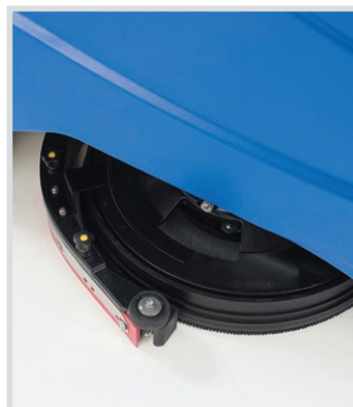
Scrub Deck The scrub deck features a rugged industrial 3-lug attachment system for maximum durability and low total cost of ownership.