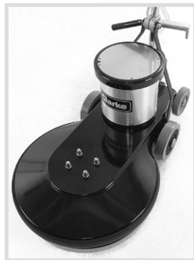
Cast aluminum chassis.